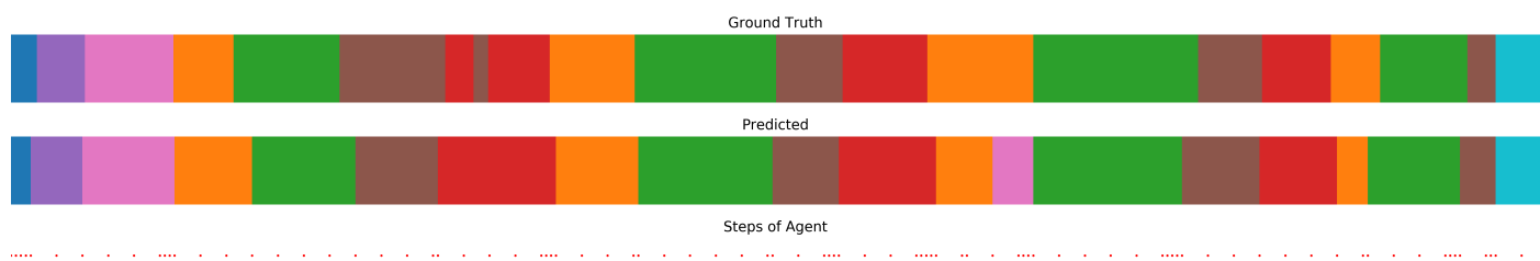
Fig. 5. Additional prediction example #5. Ditto.